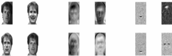
Fig. 2 Some original (left), PCA (center) and ICA (right) basis images for the Yale Face Database

Reference [73] combine SVM and Independent Component Analysis (ICA) techniques for the face recognition problem. ICA can be considered as a generalization of Principle Component Analysis. Fig. 2 shows the difference between PCA and ICA basis images.