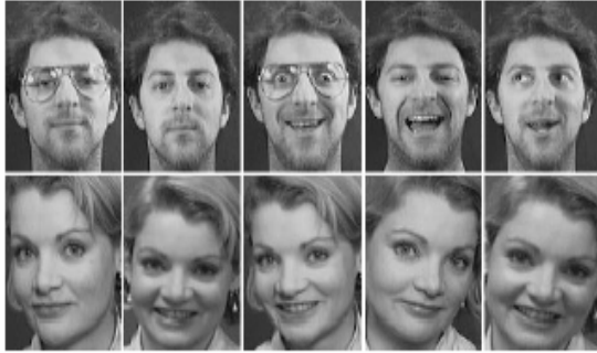
Fig. 3 Sample images obtained from ORL database

pattern with 40 classes. Moreover, comparison with other known results on the same database. Table V shows a summary of the performance of various systems for which results using the ORL database are available. The proposed method showed the best performance and significant reduction of error rate (44.7%) from the second best performing system—convolutional NN.